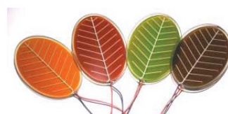
Fig. 3 Leaf-shaped transparent DSCs with four colors.