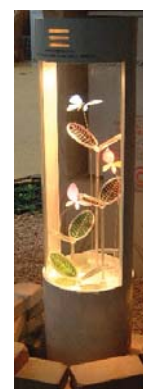
Fig. 4 Art object of a plant with leaves of DSCs colored yellow, red, light-green and dark-green, exhibited at the TOYOTA Group Pavilion in EXPO 2005.